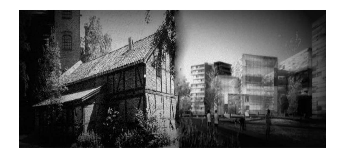
- An insight into Aker's DNA and important events from the past 25 years