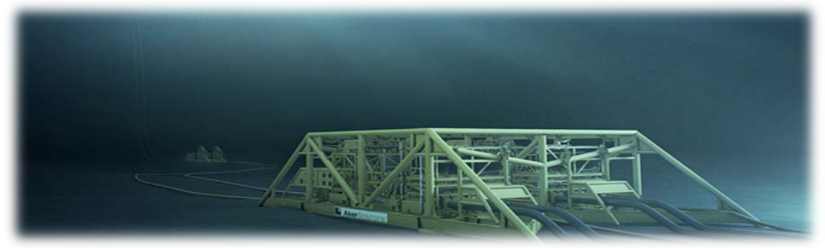
Aasgard subsea gas compression system

Another major event highlighted by two of our subjects (2 & 3) that has captured the eye of many in the industry and created a lot of suspense, is the development of the Aasgard subsea gas compression system.